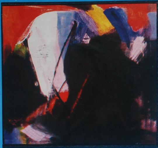
36 x 41 cm Acrylic on Canvas 1992.